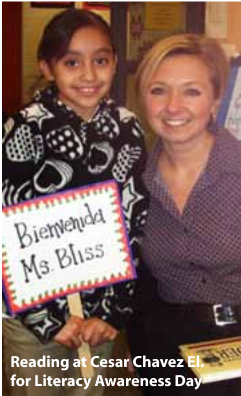
Reading at Cesar Chavez El. for Literacy Awareness Day